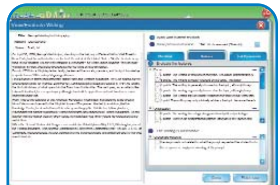
Teachers can create their own rubrics with the extensive assessment tool.